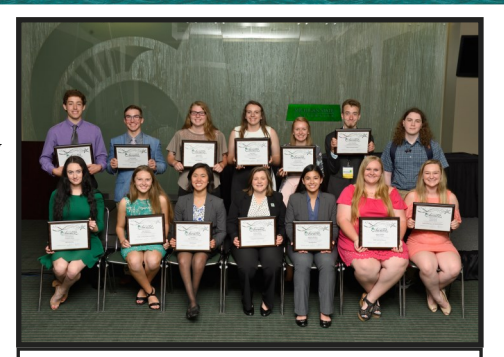
2019 State Award winners with their plaques

Michigan 4-H true leaders ages 11 and older have an opportunity to be recognized for the great work they do in 4-H and develop their career skills by completing a state award application. A Michigan 4-H State Award is the highest honor bestowed on a Michigan 4-H member and provides an opportunity to receive recognition for their engagement in rich learning experiences that result in outstanding knowledge and life-skill development.